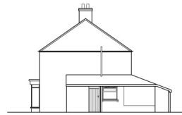
North West Elevation.