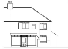
North East Elevation.

THIS COPY HAS BEEN MADE BY THE DRAWER FOR INFORMATION ONLY. IT IS NOT TO BE USED FOR ANY OTHER PURPOSES. ANY CHANGES TO THIS DRAWING MUST BE APPROVED BY THE DRAWER. THE DRAWER ACCEPTS NO LIABILITY FOR ANY DAMAGE OR LOSS OF PROFITS OR REVENUE ARISING FROM THE USE OF THIS DRAWING.